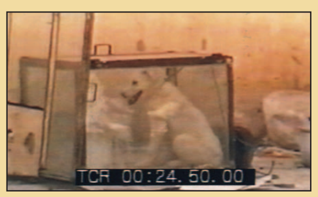
Training videos found in Afghanistan show al-Qa'ida tests of easily produced chemical agents based on cyanide.

We believe that al-Qa'ida has explored the possibility of using agricultural aircraft for large-area dissemination of biological warfare agents such as anthrax.